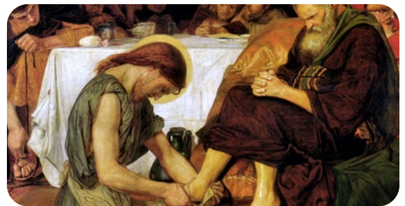
4. Eucharist and the Call to Evangelize and Serve 1