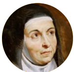
SAINT TERESA OF AVILA

If you took all of the good works done by all of the humans who have ever lived in all of history and stacked them all up and multiplied them by a million, they wouldn't equal the merit, the virtue and the worth of one Mass.