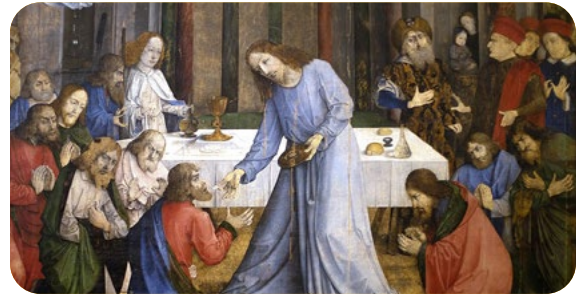
2. Real Presence and Eucharistic Worship