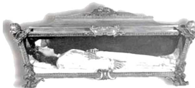
Saint Maria Goretti’s body lies incorrupt at Our Lady of Mercy in Nettuno, Italy

3. Hoping that the summer rest will be of profit to grow spiritually. I entrust young people to Mary, radiant with beauty. May she, who sustained Maria Goretti in her trial, help all, especially adolescents and youths, to discover the value and importance of chastity to build the civilization of love.